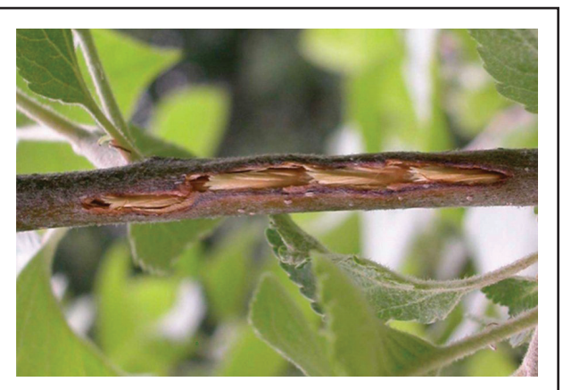
Photo 1. Cicada Damage to apple shoot- Photo credit: G. Krawczyk, Penn State University.

If there is a large population in adjacent woods or trees (hedgerows), the females will repopulate theapple orchard the next day after application and begin laying eggs again. With some materials, like Cavalary (Lambda-cyhalothrin), they seemed to land and shy away for a day, but then are back in full force a day later.