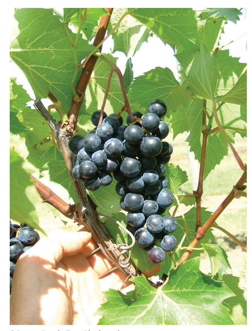
Crimson Pearl.

Crimson Pearl (T.P. 2-1-17) (USPP30,263) (aestivalis, cinerea, berlandieri, labrusca, lincecumii,