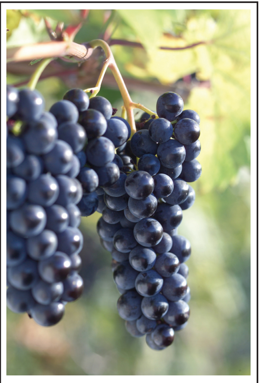
Marquette.