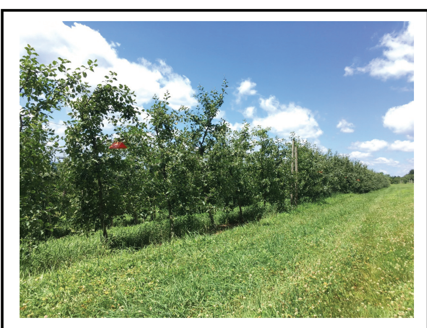
View of trap deployment for the evaluation of candidate lures for attractiveness to adult codling moth, Oriental fruit moth, and red-banded leafrollers, conducted at three commercial orchards in Massachusetts.

All traps and lures were deployed on July 11, 2019. Traps were examined for captured moths beginning on July 20 and every 7-8 days thereafter for nine weeks until September 14. All lures were renewed on August 22, about mid-way through the experiment. At each trap examination, traps were switched one position clockwise within a block to minimize the effects of position. All plots received insecticide sprays or other control methods as deemed necessary by the grower. Traps baited with the synthetic sex pheromone of each species (CM, OFM, RBLR; one trap per moth species) were deployed at each orchard to monitor male populations. For CM, the pheromone-baited traps were deployed