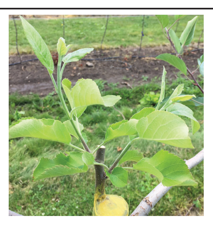
Figure 5. Once scion had established and sent out new growth, the two most upright and healthy shoots were selected as leaders, the others removed.