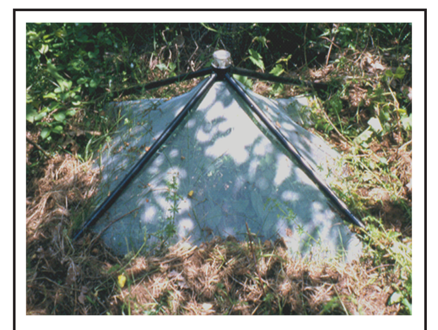
Pyramidal emergence trap used for the quantification of PC adult emergence after the application of either, the EPN Steinernema riobrave , or water (control). Trap dimensions: 1.1 x 1.1 yards at the base.

sachusetts, and 100% control in West Virginia on both years. Another nematode species, Steinernema feltiae , caused 0% and 84.6% control in 2011 and 2012, respectively, in Belchertown, and 78.2% and 69.7% control in West Virginia. These results are highly encouraging because this is the first time that biological control of