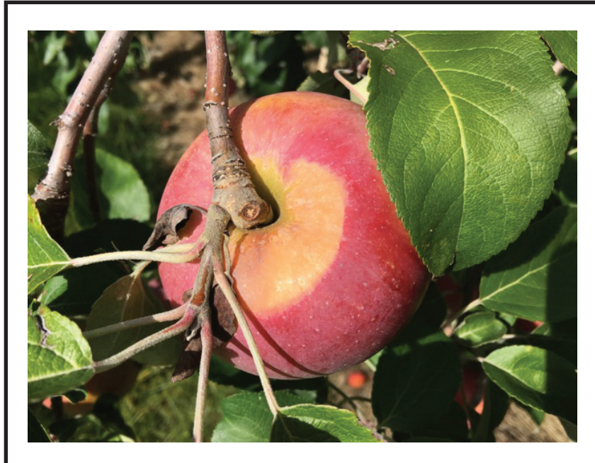
Severe sunburn on Snowsweet can have a paper-like appearance.

Tower sprayer using air induction nozzles, the sprayer was calibrated at 100 GPA. The Raynox treatment rate was 2.5 gallons per acre. Treatments were evaluated on 9 September for Incidence of sunburn as a % of fruit injured. Rows were planted north-south.