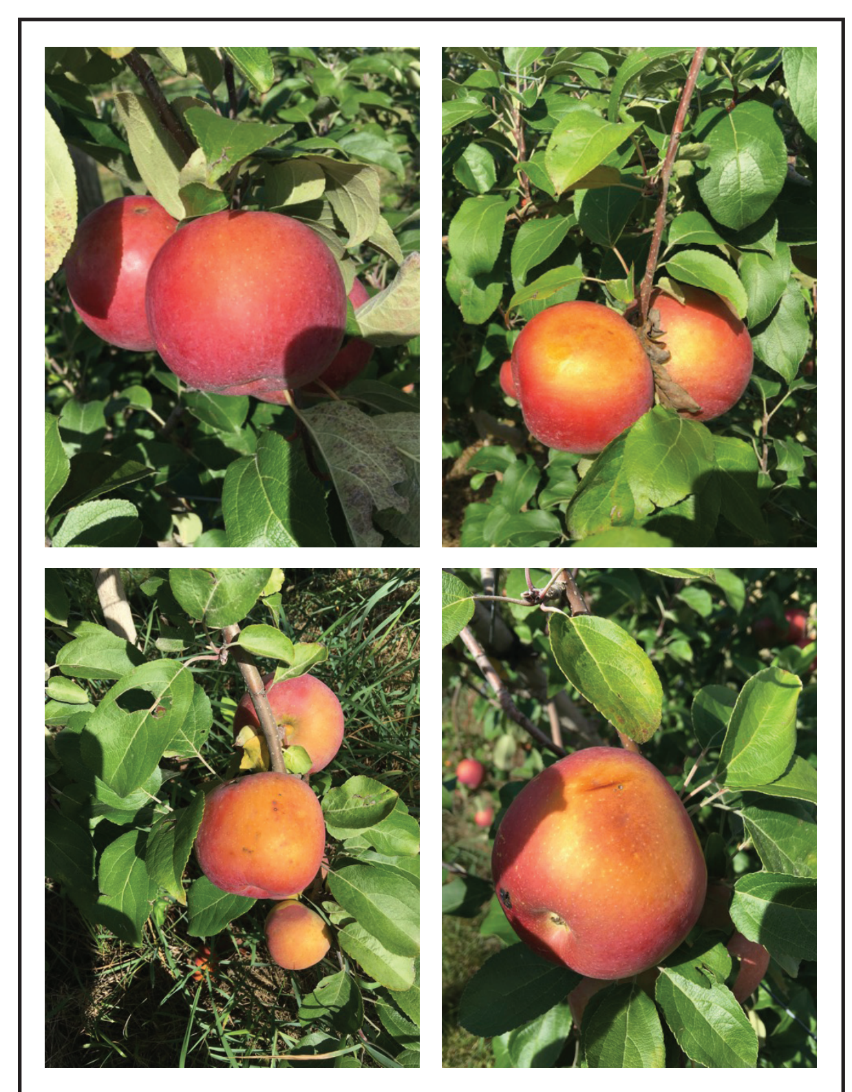
Varying degrees of of sunburn on untreated Snowsweet in 2016, Heller Orchards, Pennsylvania. Range from mild sunburn (upper right) to severe sunburn with necrosis (lower right).