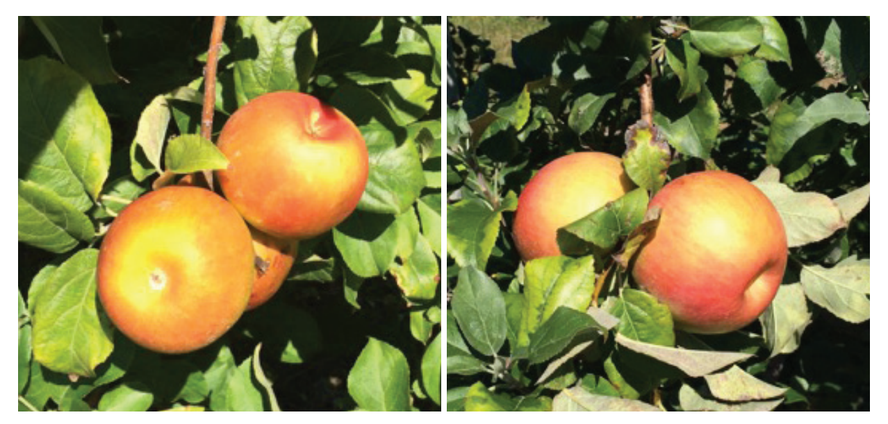
Sunburn on untreated Honeycrisp fruit in 2015, Rutgers Snyder Farm, New Jersey.

Experiment 1. The experiment was conducted in a mature apple block of 'Honeycrisp' apples planted to a tall spindle system, spaced 5' x 14'. The plot was located at the Rutgers Snyder Research and Extension Farm, Pittstown, NJ. The experiment was set up as randomized complete block design with 4 replications. Raynox was applied four times: July 5, August 4, August 15, and August 29. Treatments were applied with a Rears