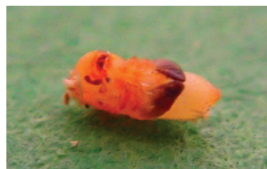
Figure 3. Black stem borer pupa.