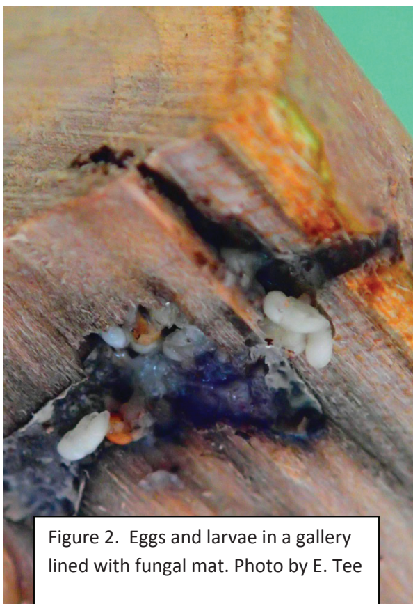
Figure 2. Eggs and larvae in a gallery lined with fungal mat.

The black stem borer was introduced from eastern Asia and first detected in NY in 1932. It has since been detected in most parts of the US. It is a general wood boring insect, in the group called Ambrosia beetles, with a huge list of suitable hosts including American beech, maple, dogwood, black walnut, oak, magnolia, and several other ornamental and forest species. It continues to spread by flight (about 2 km) until it finds a suitable host. Long distance spread to Oregon and the West has likely occurred through intracontinental movement of untreated domestic solid wood packing material and other raw timber. It has also been documented in apple and sweet cherry in 1982. We first detected black stem borer in 2013 in 6 apple sites in the Lake Ontario Fruit Region of NY, and have identified more than 30 farms with this pest.