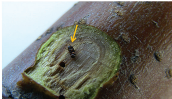
Figure 1. Black stem borer adult is only 1 mm wide and 2 mm long.

2 Cornell University – NYSAES, Geneva, NY