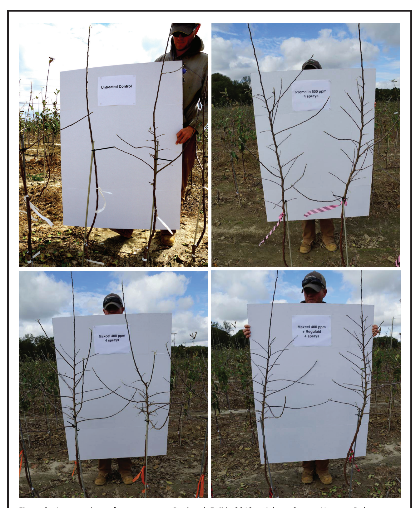
Figure 3. A comparison of treatments on Daybreak Fuji in 2013 at Adams County Nursery, Delaware.