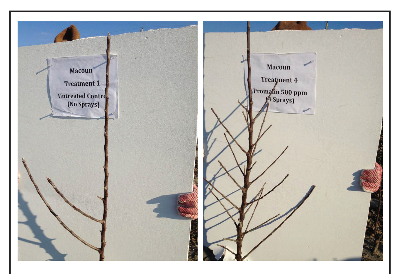
Figure 4. Macoun tree untreated or treated four times with 500 ppm Promalin plus 0.125% Regulaid in 2012.

Having highly branched trees with good height and caliper is of such critical importance to the success of newly planted high-density orchards that continued research with Maxcel and Promalin rates and timings under different growing conditions in the Mid-Atlantic and Northeast is very important. Trees grown in western North America likely will respond differently.