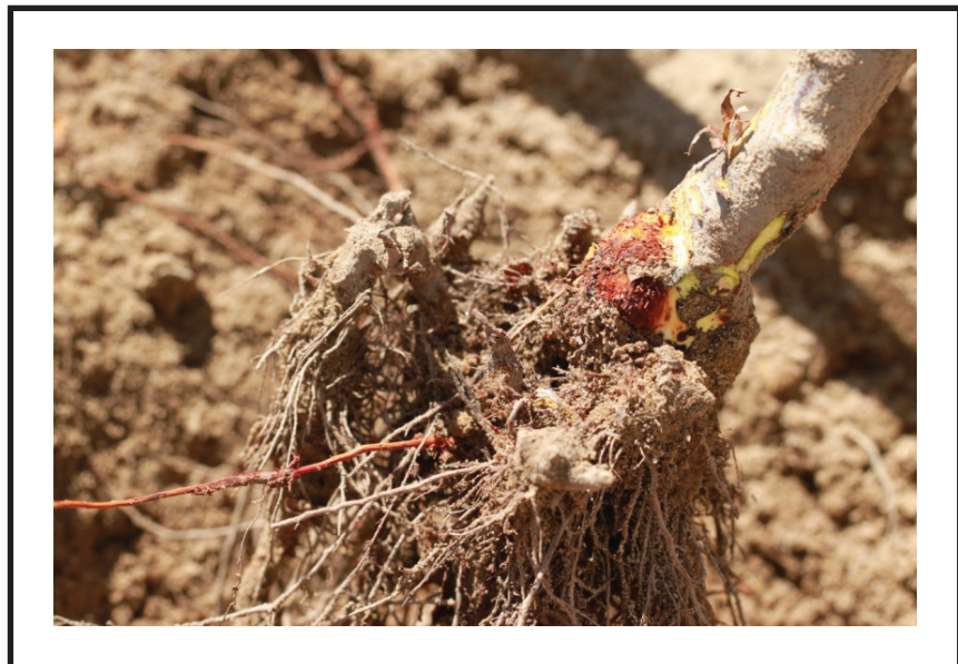
Figure 3. Root symptoms of White Rot.