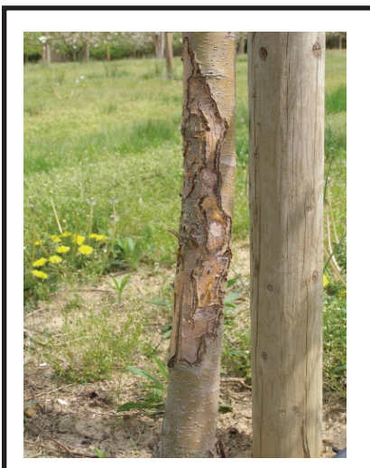
Figure 1. White Rot Trunk Canker on Gingergold apple.

Two unusual disease observations were made on tree fruit in southern New Jersey counties this past season. The first, White Rot ( B.dothididea ) appeared on newly planted trees this past spring in several orchards. While white rot is a common fruit and scaffold disease it is