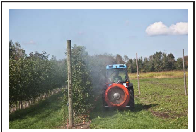
Figure 4. Airblast orchard sprayer in operation. Spray material clearly passes through the canopy. Likely, most will fall on the trees in the next row, but if weather conditions are undesirable, this material may move into non-target areas.

Drift (utilizing water-sensitive paper) was measured on a reasonably calm day. The airblast sprayer, although calibrated well, produced some drift beyond the target trees. It was estimated to