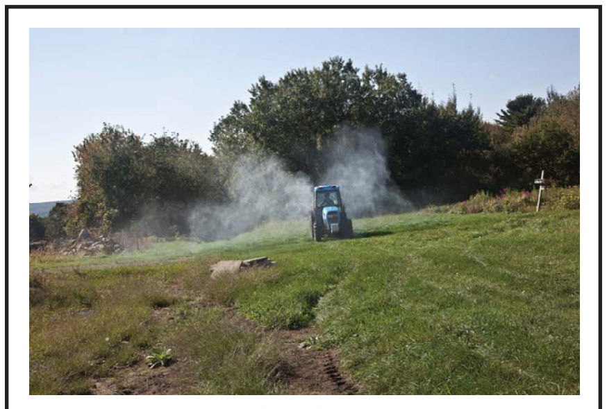
Figure 3. Even under nearly calm conditions, the airblast sprayer has the potential to create spray drift if it is not well calibrated.

be approximately 10-20% of the spray material; this amount would be much larger on a windy day. The tunnel sprayer, however, produced no measurable drift.