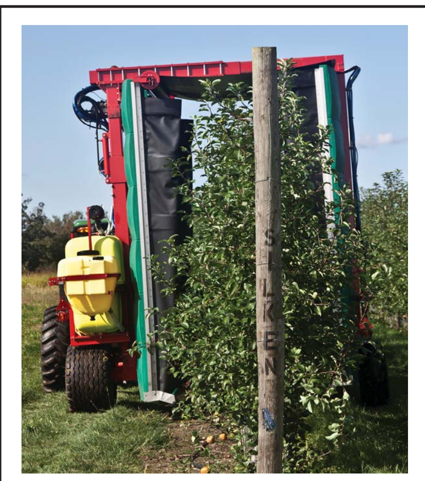
Figure 5. The Tunnel Sprayer directs material into the canopy from the outside and captures that which passes through the canopy.

Hands-on demonstrations were conducted at twilight meetings on May 17, 2011, and April 17, 2012, at the UMass Cold Spring Orchard Research & Education Center (35 and 30 farmers in attendance in 2011 and 2012, respectively), and presentations (with video) were given at three additional twilight meetings (May 18, 19, and 26, 2011) with total attendance of 129 farmers. It also was demonstrated at the 2012 Annual Summer Meeting of the Massachusetts Fruit Growers' Association at the UMass Cold Spring Orchard Research & Education Center on July 16, 2012, with approximately 100 farmers in attendance. Small-scale demonstrations were conducted several times during the two years to a total of approximately 200 individuals.