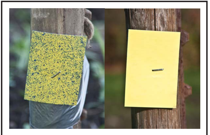
Figure 6. Water sensitive paper showing drift from the airblast sprayer (left photo) and the lack of any spray drift from the tunnel sprayer (right photo).

Educational programs began in earnest in 2011. Details of this project have been recorded in a blog: <u>http://</u><u>masscon.blogspot.com</u> (Massachusetts Containment Spraying Blog). Four video presentations are provided in the blog to describe progress during the early stages of the process. The blog has been visited a total of 1,579 times since its creation 16 months ago. The videos were also provided on YouTube (<u>http://</u><u>www.youtube.com/user/wrautio1</u>) and, in total, have been viewed 3,142 times.