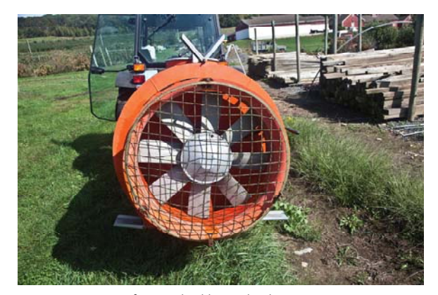
Figure 2. Rear view of a typical airblast orchard sprayer.