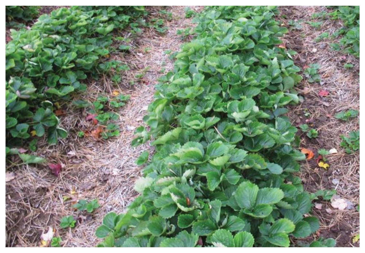
Renovated strawberry bed in early fall.

<u>Mowing off the old foliage.</u> During the growing season foliar diseases, such as the many fungal leaf spots and bacterial angular leaf spot, attack the plants reducing functional leaf surface. This won't kill the plants but does have the potential to reduce yield. Mowing removes the diseased foliage, shredding it for rapid decomposition which results in reduced inoculum for the following season. It also knocks down foliar insect pests including mites. Importantly, this practice encourages new vegetative growth, opens up the plant to better sunlight penetration for flower bud formation. It is important to avoid hitting the crown with the