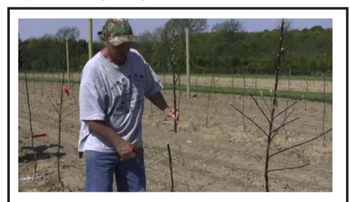
Figure 1. For the heading treatment, trees were cut 40 inches from the soil surface soon after planting.

that is not necessarily desirable in high-density orchards. Bud 'notching' and benzyladenine (BA) application are two other methods to promote branching in young trees.