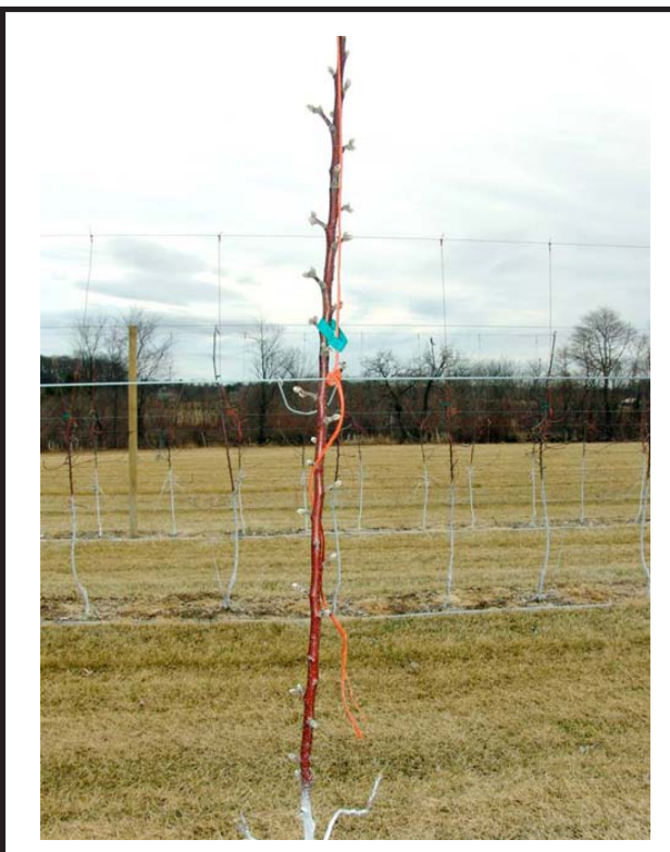
Figure 4. Untreated tree after one season.