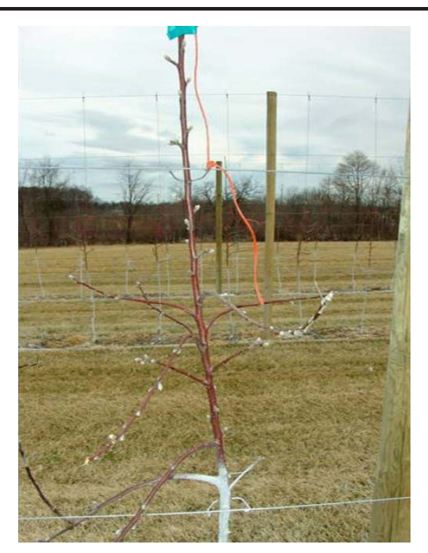
Figure 5. Notched tree after one season. W.P. Cowgill photo.

a rate of 375 ppm (12 ounces/5 gallons of water) when new terminal growth was approximately 1 to 3 inches long. There were five, single-tree repetitions of the six treatment combinations. Measurements of leader growth, trunk circumference, total shoot growth (shoots longer than 4 inches), and shoots/spurs less than 4 inches long (New Jersey only) in fall 2008. In 2009, the number of flowers (spring), number of fruit (fall), and trunk circumference were measured in Massachusetts only.