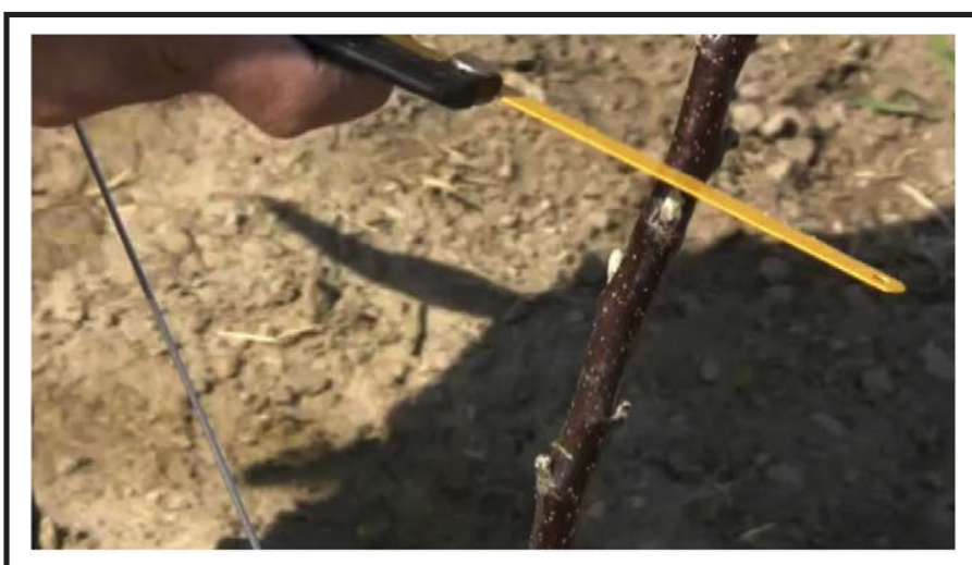
Figure 2. Notching was performed with a hacksaw on 10 buds between 30 and 50 inches from the soil surface soon after planting.

When planting high-density apple orchards on dwarf rootstocks, it is best to use well branched nursery trees so that early production and profitability are maximized. Often, however, nursery trees arrive with less than the optimum number of branches, or worse, are nearly 'whips' with no branches at all. Hence, steps are often taken to promote branching. In semi-dwarf orchard systems at wider spacing a heading cut is very effective at creating branches, however, may have an invigorating effect