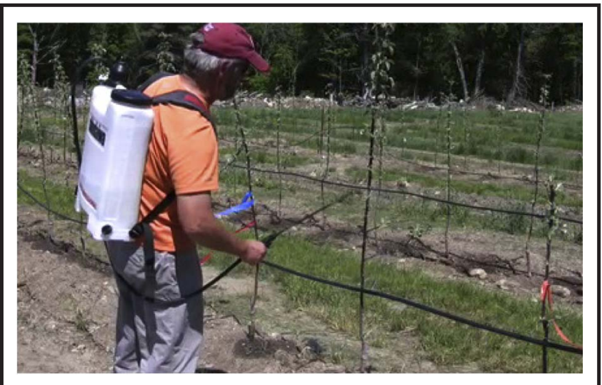
Figure 3. BA (375 ppm) was applied by backpack sprayer between 30 and 50 inches from the soil surface soon after planting.

notching) and BA application (with or without) in two locations (Massachusetts and New Jersey) soon after planting in the orchard. The control was not headed or notched. The heading treatment (Figure 1) cut trees to approximately 40 inches in height shortly after planting. For the notching treatment (Figure 2), 10 buds between 30 and 50 inches from the soil surface were notched with a hack-saw blade also shortly after planting. For trees receiving BA, Promalin® Valent U.S.A., Figure 3) was applied to the leader (30 and 50 inches from the soil surface) using a backpack sprayer at